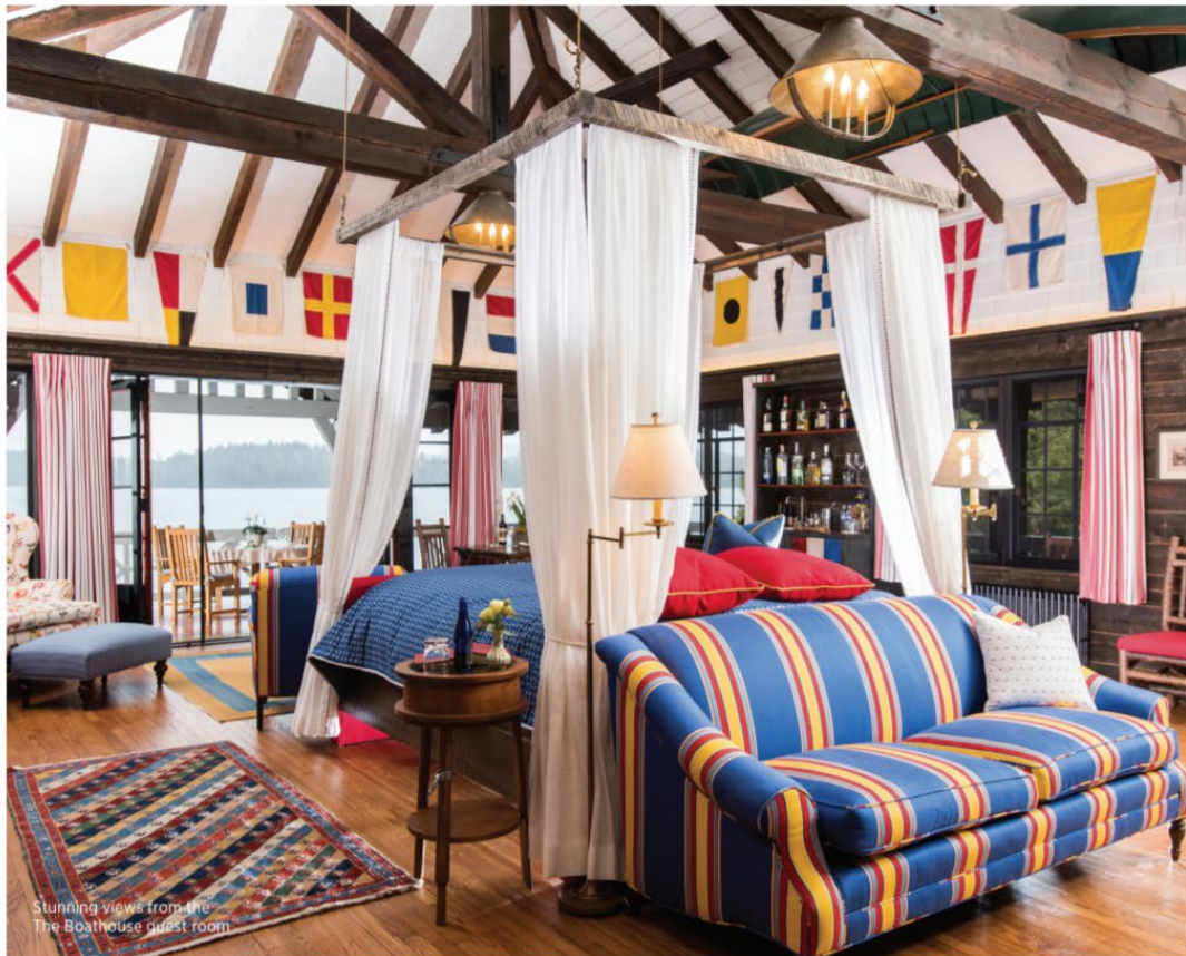
Stunning views from the Boathouse guest room