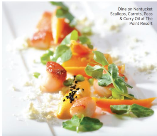
Dine on Nantucket Scallops, Carrots, Peas & Curry Oil at The Point Resort

where guests can join in the Great Hall, or, on the Great Hall Terrace for light snacks and refreshing drinks. A perfect way to rehydrate, relax, and get ready for a tremendous dining experience in the evening time. And, in the spirit of "we are always here for you," the accommodating staff thrives on responding to guests' flights of whimsy. A casual inquiry about a massage results in the arrival of a masseuse at one's door thirty minutes later. A last-minute desire to explore the historic town of Lake Placid, New York is fulfilled with the delivery of a Mercedes-Benz luxury SUV stocked with chilled water, dried fruit, and guide books.