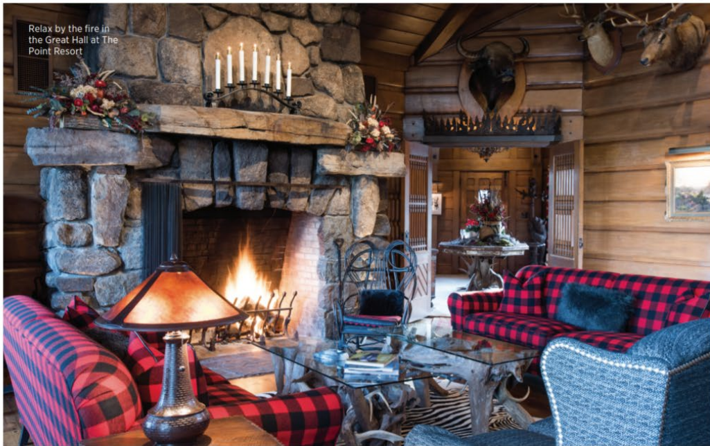
Relax by the fire in the Great Hall at The Point Resort