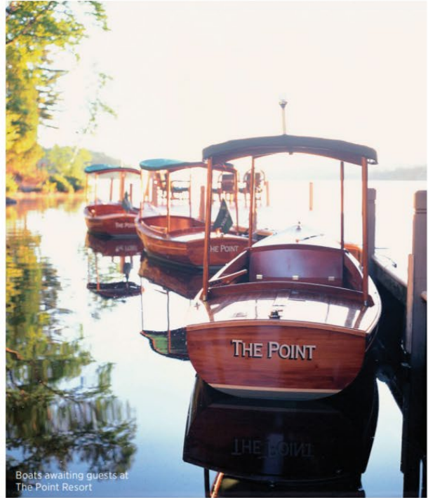
Boats awaiting guests at The Point Resort

The options for dining are as equally varied as the options for imbibing. While breakfast and lunch are delightful and may be enjoyed anytime and anywhere, The Point's dinners are unpar-