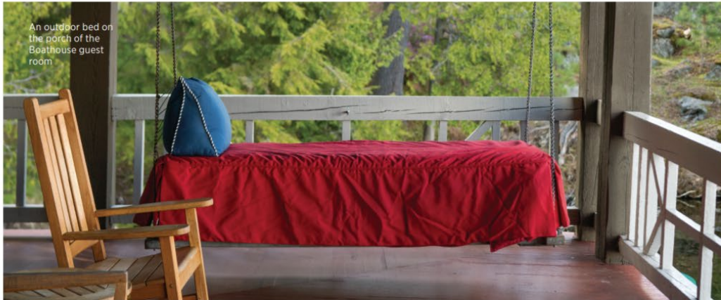
An outdoor bed on the porch of the Boathouse guest room

For additional information call 800-255-3530; 518-891-5674 or visit thepointresort.com .