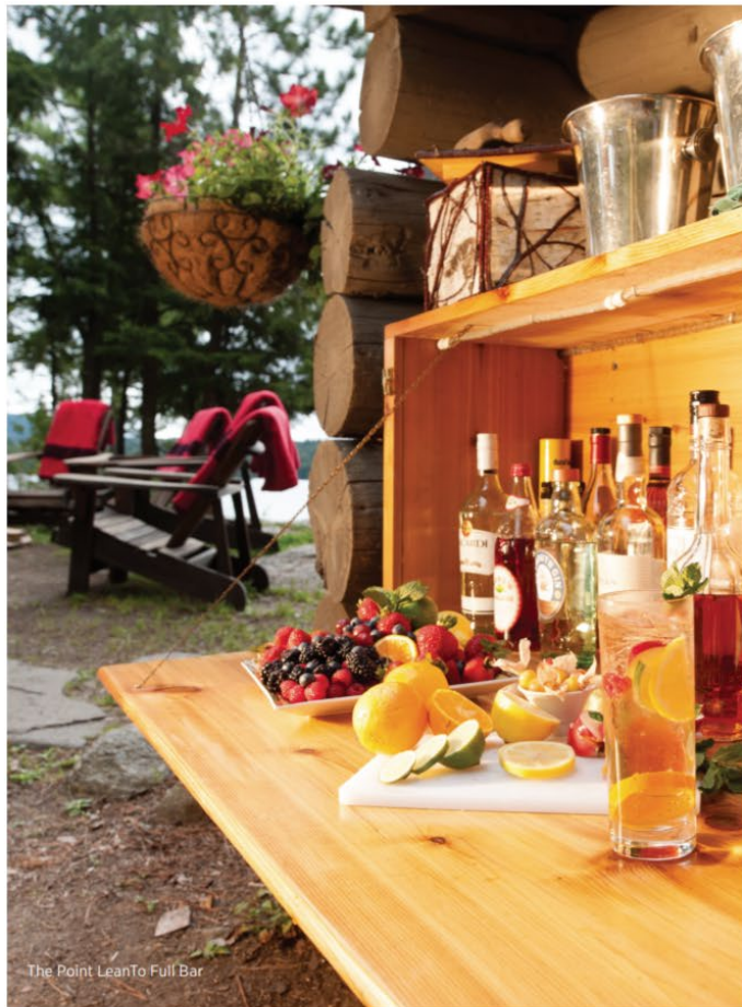
The Point LeanTo Full Bar

Guests experience the Point's exceptional level of service before even setting foot on the 75-acre property. Solicitous emails sent before arrival to establish food and activity preferences end with the phrase "we are always here for you." As the food and activity options are nearly limitless, it is wise to give some thought to these preferences. Unwind in the afternoon with high tea at 4:00 p.m. every afternoon